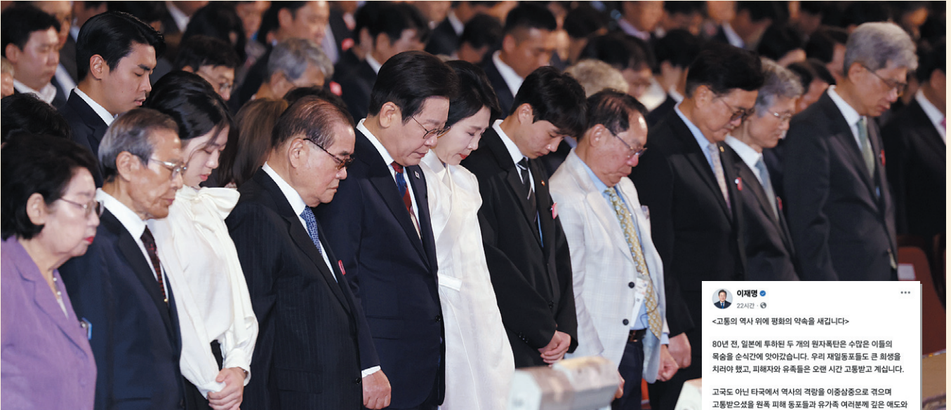
President Lee Jae Myung (5th from L) and first lady Kim Hea Kyung (6th from L) observe a moment of silence for patriotic martyrs and national heroes at the 80th Liberation Day celebration held at Seoul's Sejong Center for the Performing Arts on Aug. 15.

‘We will steadfastly uphold value of peace to prevent horrors of war from repeating’